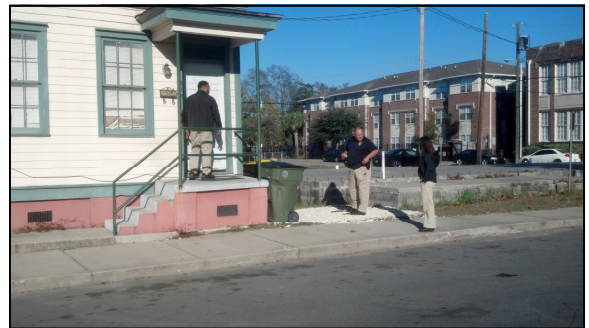
In Savannah, the Parole Board participated in "Operation Safe Holiday," December 16th. The operation included the Savannah Metropolitan Police Department, Chatham County Juvenile Justice and Probation (Dept. of Corrections).