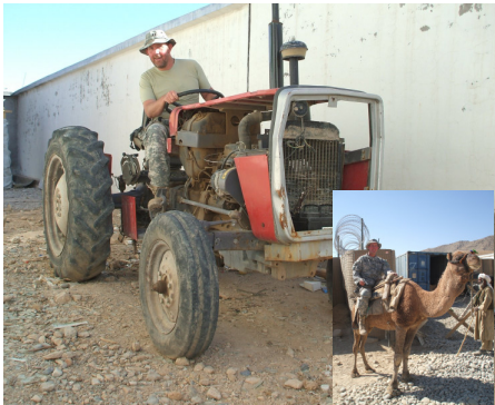
Capt. McCall got this tractor running. (Insert-"Likes to drive anything!")