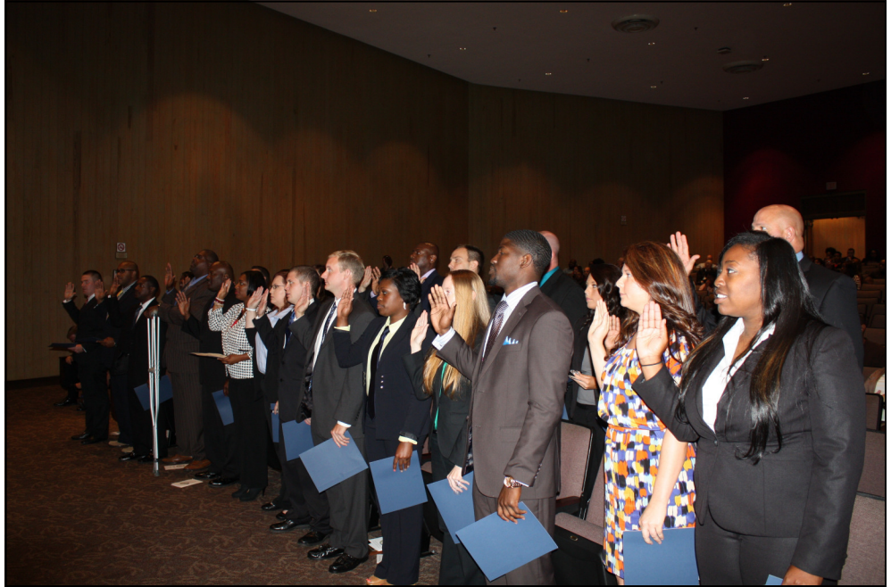
New parole officers take the oath of office following their graduation ceremony on October 11, 2013.

The Parole Board employs approximately 300 officers. The average parole caseload of offenders is 87.